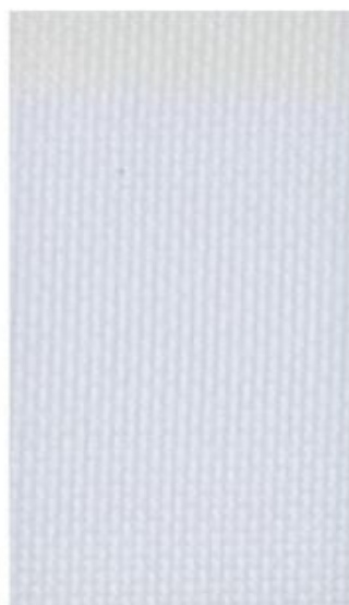
SX 1800-C(A) COOL