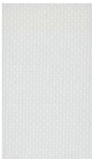
SX 1800-H(A) CLEAR